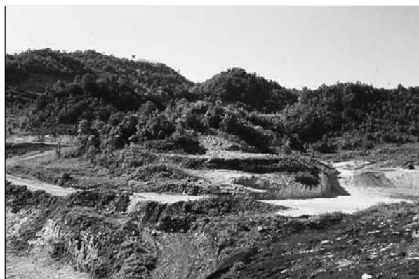
Fig. 8: Bauxite mining, Jamaica.

Much of the Caribbean karst remains in rural land uses, but urbanization is increasing, particularly in the vicinity of large cities such as San Juan, Port of Spain, Montego Bay, St Johns and Bridgetown. Urban development places increasing demands on the karst for construction materials, and changes irrevocably the inherent structure of the karst land surface, its landforms and hydrology. Large urban areas also exacerbate demands on karst groundwater resources.