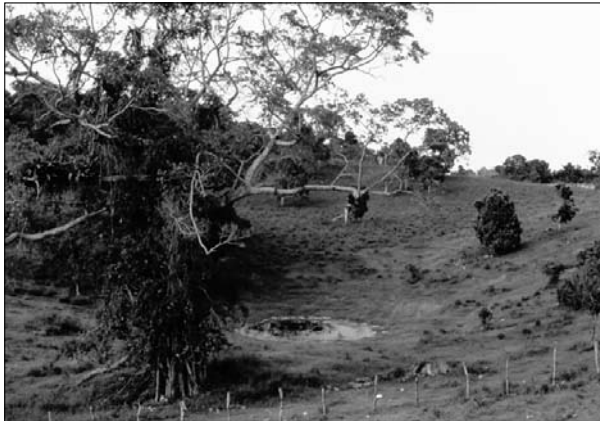
Fig. 2: Doline, Jamaica.

ciated with bauxitic infills. Vegetation varies from xerophytic scrub to wet tropical broadleaf forest, with many species endemic to specific islands.