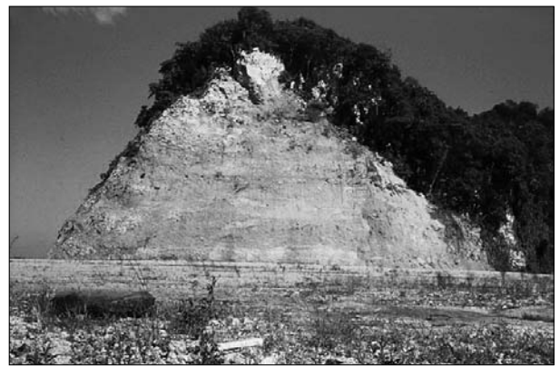
Fig. 5: Tower karst, Puerto Rico.