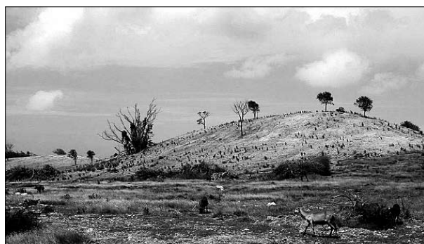
Fig. 7: Soil degradation, Antigua.

Forest clearance and agriculture have had profound and long-term effects on the karst landscape. Much of the karst is utilized for some form of agriculture, and these activities are increasing steadily. Loss of native vegetation and declining habitat apart, some Caribbean karst area soils have been degraded, and their physical and chemical characteristics modified by plowing, cultivation, drainage modification and use of chemicals (Fig. 7). Sediment eroded from agricultural lands frequently has blocked sinkholes and other karst drainage features, and flooding has been exacerbated locally by infilling of sinks and depressions.