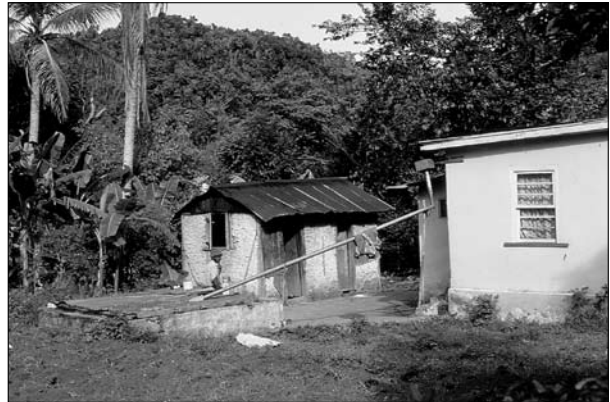
Fig. 6: Rainwater collection, Belize.

Occasional collapse and subsidence also occur, although the Caribbean has not yet suffered their effects as catastrophically as elsewhere (Waltham et al. 2005). Certain sites, such as lower slopes and depression bases, are especially prone to collapse, but only about 10-15% of sites show any evidence of collapse or subsidence, suggesting that collapse probabilities are generally low (Day 1984, 2003a). Despite these relatively low probabilities, both ground surface collapse and subsidence represent an increasing threat to developing infrastructure, such as highways and public service facilities, plus a minor hazard to rural dwellings and livestock. Slope failure also poses a minor to moderate hazard to buildings, roads and other structures, although one that is rarely recognized (Day 1978).