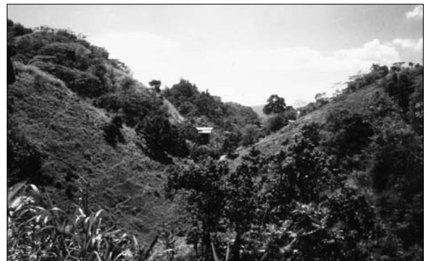
Fig. 4: Cone karst, Trinidad.

Other studies have emphasized the variability of the Caribbean carbonate sequences, and how this has influenced karst development (e.g., Nunez Jimenez 1984; Monroe 1976). Perhaps most significantly, the Caribbean islands, in particular the Bahamas, nurtured the development of the Carbonate Island Karst Model (CIKM), which recognizes that eogenic island karst development is distinct from karst development in larger islands or continental settings (Mylroie 2004; Mylroie & Carew 1990, 1995, 2000).