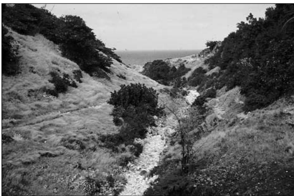
Fig. 3: Dry valley, Barbados.