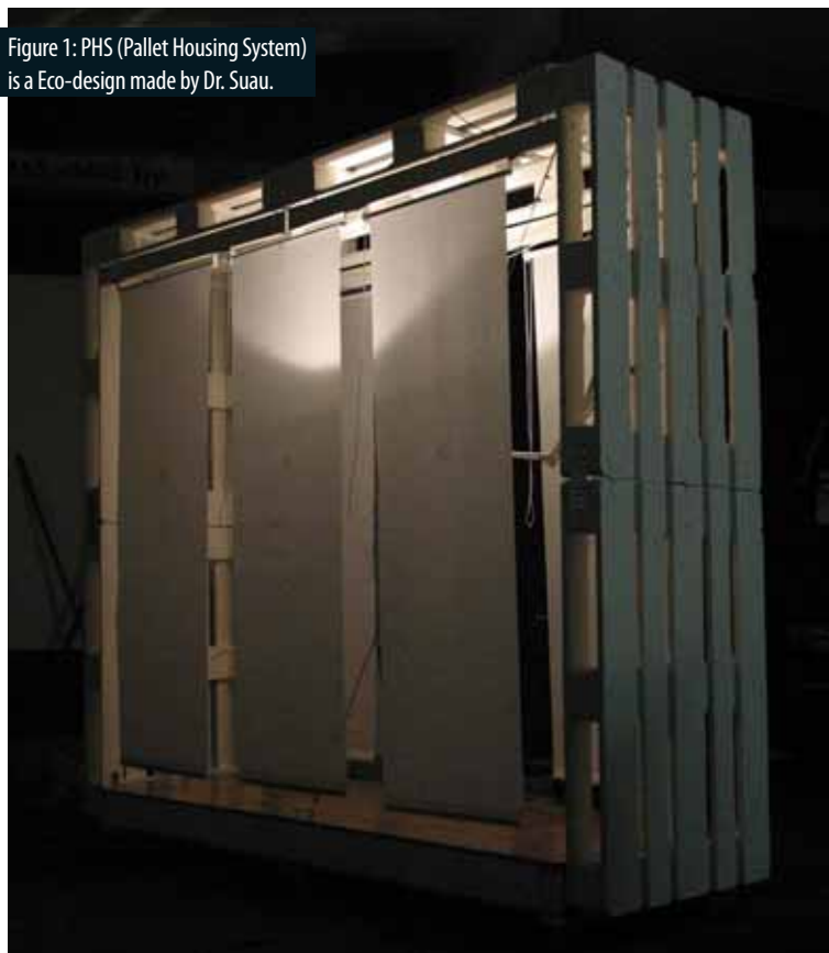
Figure 1: PHS (Pallet Housing System) is a Eco-design made by Dr. Suau.

If we relate this statement in architectural practice, what happens when foundations become smaller, lighter or simply removed? In this case, minimum would not mean minuscule but would imply removing from design its superfluous, redundant or useless properties. Consequently the search for elementary living is not a trend applicable in impoverished cities or cultures but is rather an appropriate strategy for dealing with playable design factors (Figure 1). What level of playability do we take into consideration within the design process?