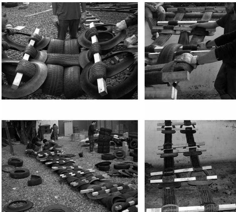
Figure 3: Tyrespace © project is another new structural games. In 2008, I led a Master workshop at the School of Architecture PUC in Santiago de Chile. In two weeks, 6 small groups produced a 12m span footpath bridge only with car tyres. They carried out several empirical tests using all the components and properties of each car tyre. The preliminary structural tests with strapping connectors failed. Those frames required extra-stiffness. Nevertheless the use of strapping methods showed capability to build up random tissue.

Cubic and Triangular (A-frame) solutions. The modules are assembled and embraced mainly by boards, tensile components or metal connectors. These components are available in the shipping and packaging manufacturing. The PHS© has been climatically tested by employing passive techniques such as orientation, building shape, and colours, available local materials, and shading devices. They have similar base modulation: 80cms x 120cm. In terms of spatial distribution, the PHS© provides a central kitchen/bath core with sleeping room.