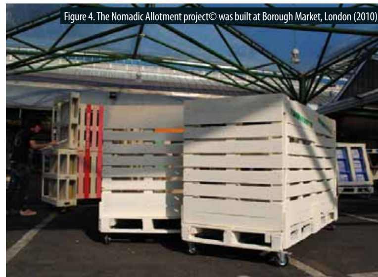
Figure 4. The Nomadic Allotment project© was built at Borough Market, London (2010).

It consisted in the application of PHS© assemblage system applied in modular and mobile agro-devices.