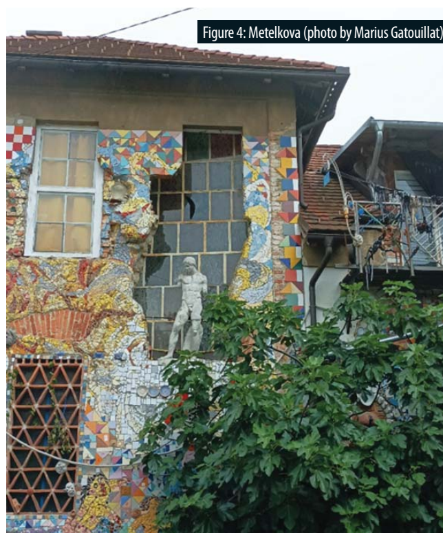
Figure 4: Metelkova.