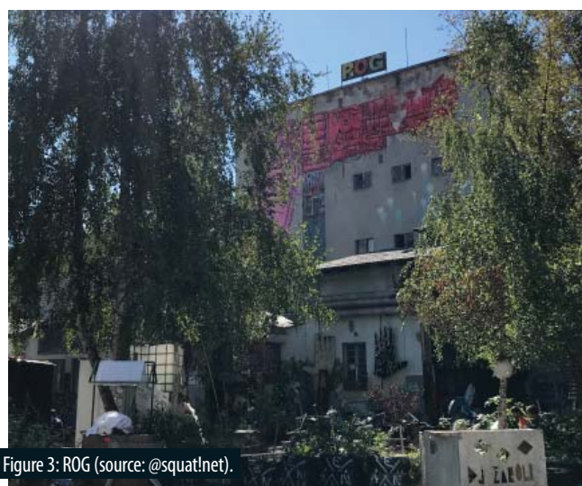
Figure 3: ROG.

In concrete terms, these occupied spaces serve as artist residences, as seen in Metelkova or formerly in ROG, where artists are sometimes invited, sometimes accepted upon request, for variable periods and all kinds of productions. They function as environmental laboratories, as seen in Krater and Onkraj Gradbišča, where techniques of gardening, biodiversity preservation and research on natural materials are developed. They all serve as places for meeting, exchanging and educating, providing environments conducive to creation and the dissemination of specific knowledge and cultures.