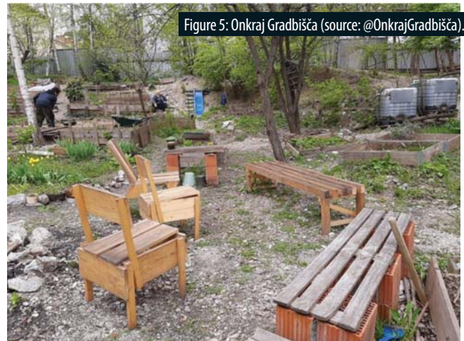
Figure 5: Onkraj Gradbišča.

« The space has all these workshops: the wood workshop, the paper workshop, the mycelium biocomposite laboratory. So these workshops are open, if a students or anybody have a