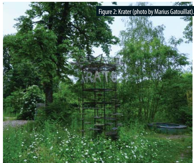
Figure 2: Krater.

In the case of PLAC, the need for free and open space to organise events of all kinds, prompted a group of a few dozen people to squat this place. After the eviction of ROG, there was a need to find a non-privatised space where people could gather freely. This need was also coupled with the desire not to be consistently in a consumer-oriented or service-client relationship. Since these expectations could not be met by ordinary institutions, the group of citizens decided to take matters into their own hands and satisfy their requests themselves.