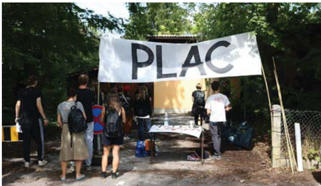
Figure 6: Plac.