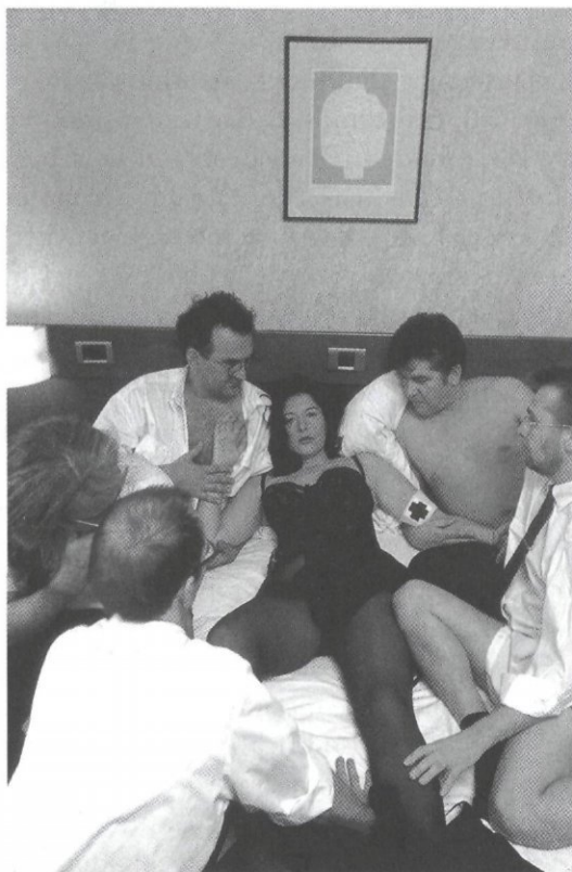
IRWIN, Name Pickers (1998). In collaboration with Marina Abramović.

In Tanja Ostojić it is precisely the pubic Malevich under the stylish gowns, the black square so to speak embodied on the topological place, and not some kind of “wallpaper, poster Malevich.” In between her legs the real/impossible kernel of the art power machine received the only possible appearance in flesh and blood. The so called touchy nodal point of contention in art today, is the cannibalistic attitude of the art capitalist power edifice that displaced and abstracted everything and everybody only for the sake of its proper survival. Malevich stands at the begin-