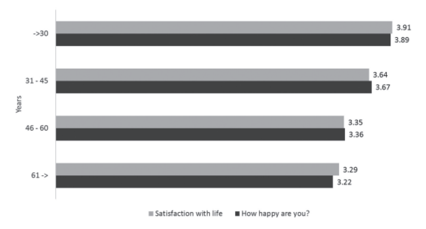
Graph 1: THE AVERAGE ESTIMATE OF RESPONSES (1 – LOWEST ESTIMATE, 5 – HIGHEST ESTIMATE) TO QUESTIONS ABOUT HAPPINESS AND SATISFACTION WITH LIFE

Further, Slovenian Public Opinion surveys from the past few years report about a high level of satisfaction and optimism in young people. These surveys enable a comparison between different age categories. Among all age categories of the population in Slovenia, youth under 30 years are the happiest and most satisfied with their lives (Politbarometer, 2014; Slovenian Public Opinion, 2015; Slovenian Public Opinion, 2016).