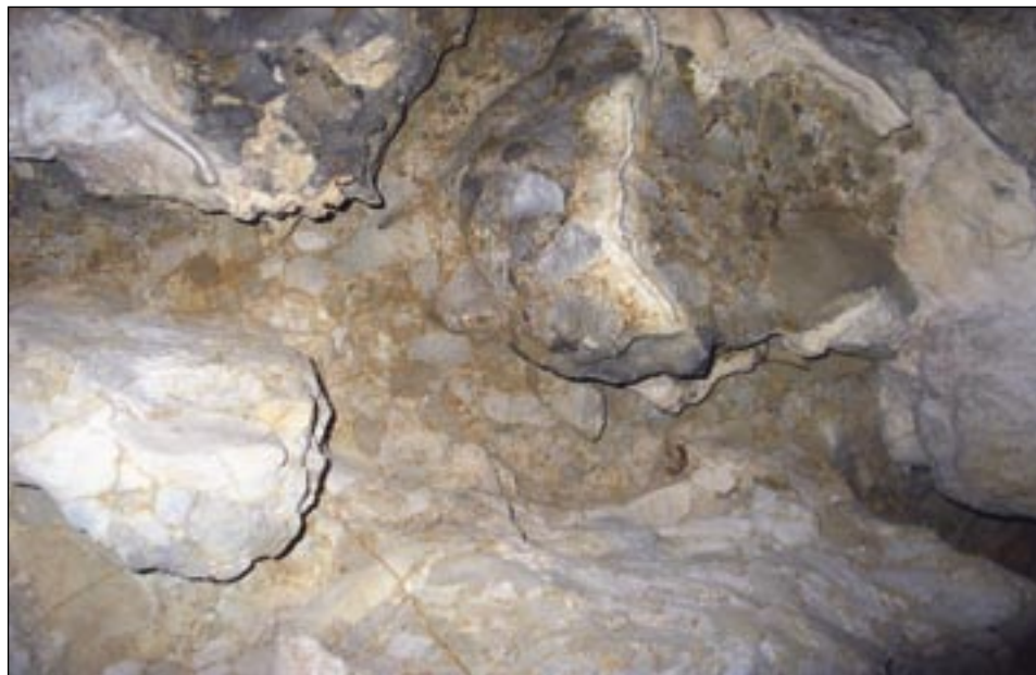
Figure 6: The above-sediment rock forms on the ceiling. Slika 6: Nadnaplavinske skalne oblike na stropu.

In the W part of the cave the cross Dinaric fissures (NE-SW) are cut by Dinaric (NW-SE) ori-