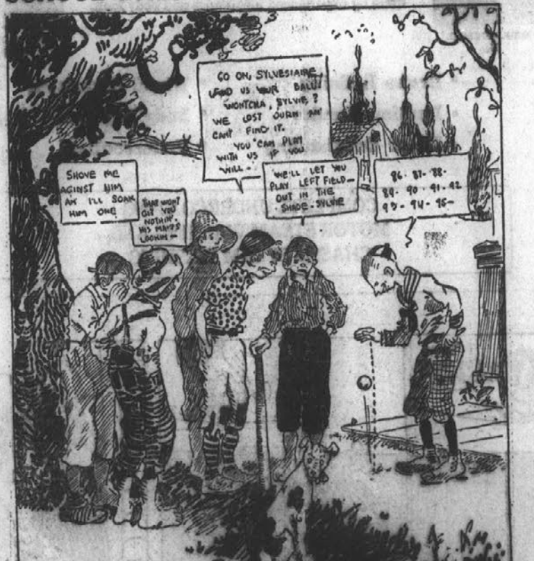
THE NATIONAL GAME

GROUP HOLY COMMUNION AT ST. LAWRENCE CHURCH The St. Vitus Holy Name Society will receive Holy Communion in a body this Sunday at St. Lawrence Church.