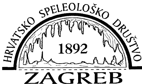
Fig. 1.- The sign of the Croatian Speleological Association (Hrvatsko speleološko društvo). The first speleological organization in Croatia was founded in year 1892 in Rakovica, near Plitvice lakes.