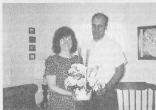
Br. 32, Euclid, OH