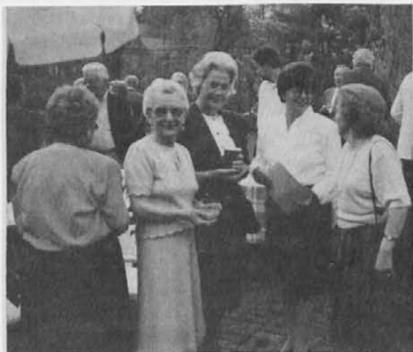
Iča z nekaterimi gosti ob slovesnem praznovanju svoje 70. letnice