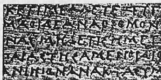
Example of Greek (GRŠKO) Lettering

Let us see the examples of those pictographs: