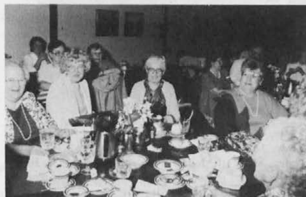
Members enjoying the Branch's Christmas parties with their families and friends.