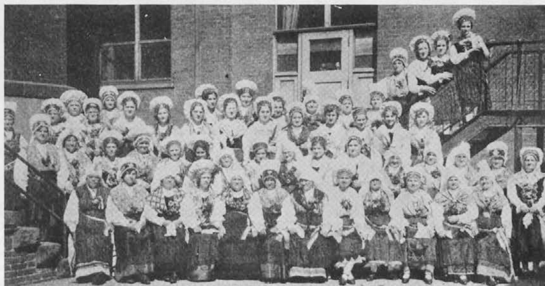
In the heyday of Slovenian culturalism in 1935, hundreds of our members proudly identified their Slovenian heritage by wearing their beautiful Slovenian national costumes in public. Members from Branches 47 and 15 are seen here. The occasion was the unveiling and dedication of the Baraga Statue in Cleveland's Cultural Gardens.