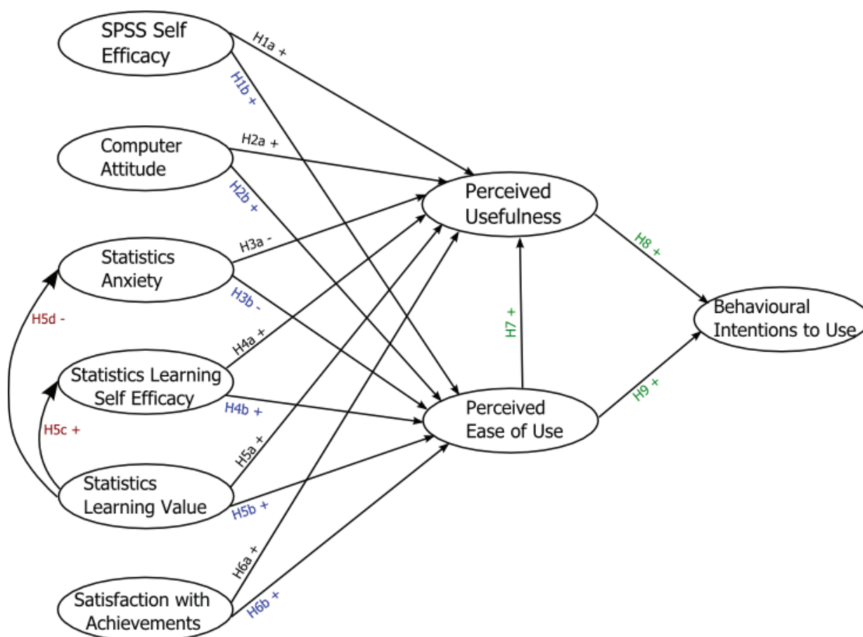
Figure 2: The extended TAM for analysing the acceptance of SPSS among the students of social sciences