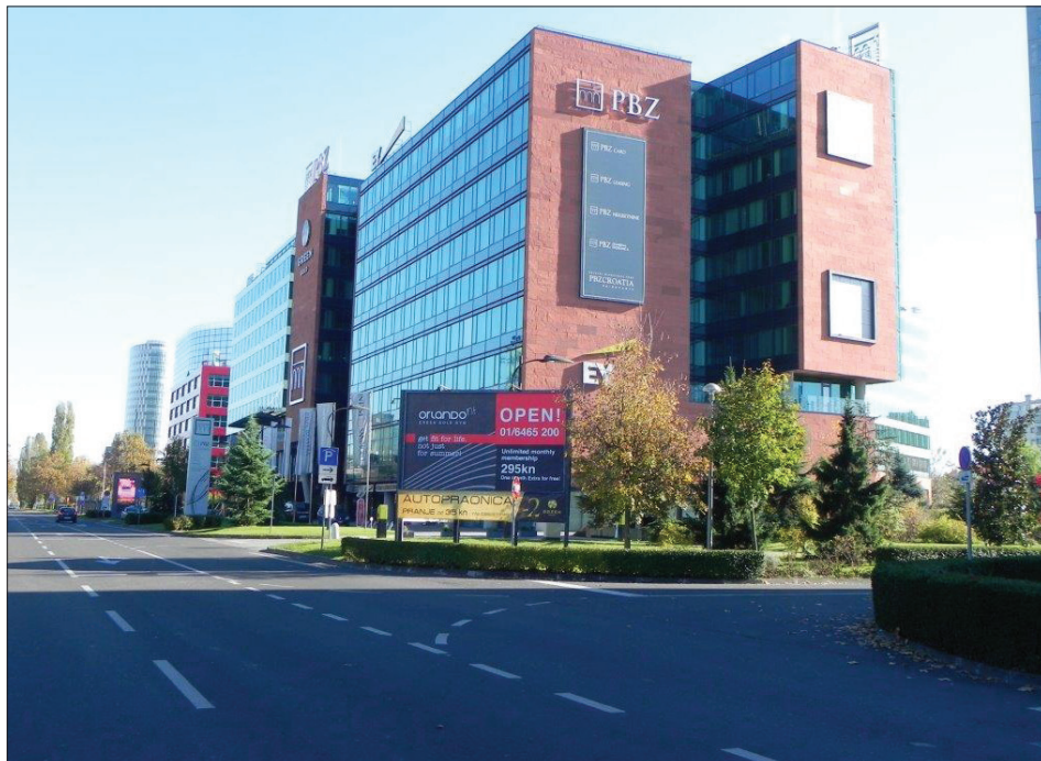
Figure 4: New CBD with business buildings in Radnička street. Slika 4: Novi CBD s poslovnim stambama na Radničkoj ulici.

Conversion of land and construction of office buildings point to growing internationalisation or contribute to painting an imitation of Western cities through the construction of large office buildings and skyscrapers that act as symbols of financial and economic elites (Zlatař, 2013). It should be noted that the construction started following the changes to the Master Plan, allowing the construction of commercial and residential skyscrapers higher than nine floors after more than 20 years. In this sense, the sites where there was free land or land suitable for conversion were mostly used.