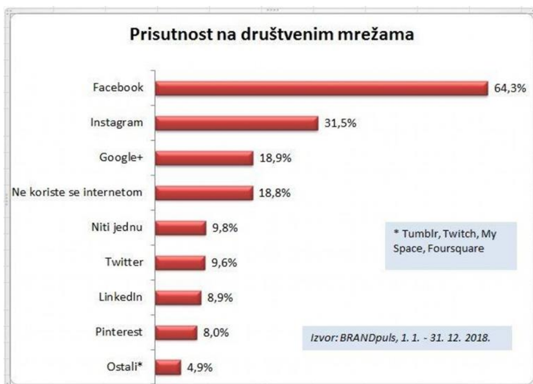
Figure 3: The presence of social networks in Croatia;

As can be seen from Figure 3, in Croatia, according to the research conducted in 2019, the most used social networks were FB, IG and Google+. Facebook is still convincingly the most present social network in Croatia. According to the BRANDpuls research, 64 percent of respondents use this social network, which is more than twice as many as the first follower of Instagram (31%), and in third place with the presence or absence of 28.6% is - 'nobody'. Namely, almost 19 percent of respondents do not use the Internet, and another 9.8% of Internet users are not on social networks. Twitter (10%), LinkedIn (9%) and Pinterest (8%) are more significantly present. Other social networks - Tumblr, Twitch, MySpace and Foursquare - together have less than five percent presence.