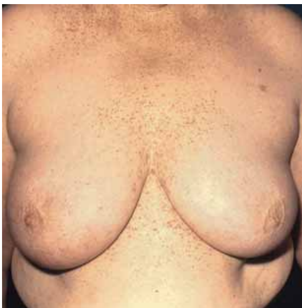
Figure 1. Darier's disease: hyperkeratotic papules in seborrheic area.