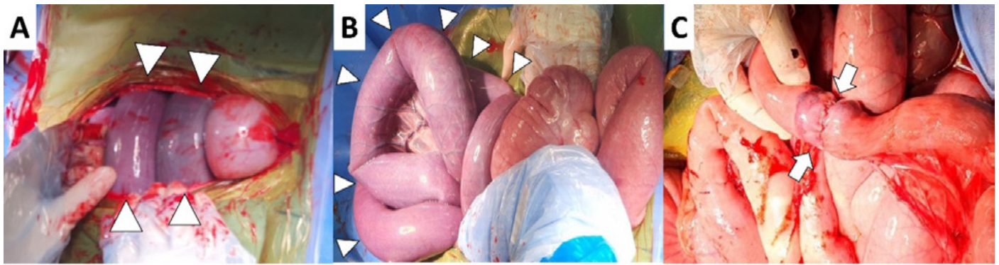
Figure 1: Detailed small intestine found on the first surgery at four-month of age. The strangulated small intestine was identified (A, B; arrowheads) and end-to-end jejunio-ileal anastomosis was performed (C; arrows)

membranes. A rectal examination was unremarkable. The hematology was within normal ranges. Serum biochemical analysis revealed elevated lactate (3.6 mmol/l, reference range, 1–1.5 mmol/l), hyperglycemia (156 mg/dl; reference range, 65–110 mg/dl), elevated creatinine kinase (2,003 U/l; reference range 120–470 U/l), decreased calcium (10.8 mg/dl, reference range; 11.5–14.2 mg/dl) and globulin (2.7 g/dl; reference range, 2.7–5.0 g/dl) levels. Abdominal ultrasonography revealed duodenal dilation (oval-shaped, 3.78 cm × 7.55 cm) with intraluminal fluid accumulation in almost the entire duodenal segment on the right side (Figure 2A).