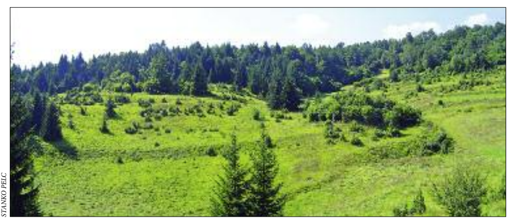
Figure 1: The nature is »taking back« former farmland in Kostelsko region along the border with Croatia.

people moved to cities and suburban settlements and only older people with low level of education or even without it remained. These settlements were in hilly countryside in the hinterland of Koper alpine valleys in northern Slovenia and in high hilly area on the left bank of Drava river along Austrian border.