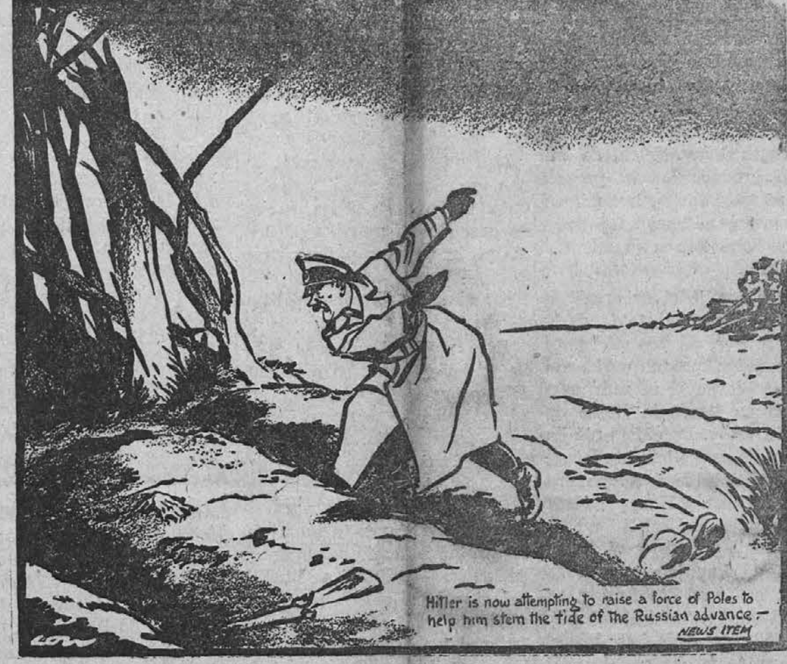
Hitler is now attempting to raise a force of Poles to help him stem the tide of the Russian advance.

Vstanite, vi mrtvi, in mi sledite v boj proti barbarizmu!