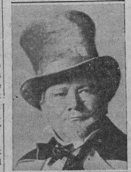
JOHN CHARLES THOMAS

John Charles Thomas, the popular American baritone who has been a star in the four fields of grand opera, light opera, concert and radio, will be held in "La Traviata" and "Aida" during the seventeenth spring festival of the Metropolitan Opera Association in Cleveland's Public Hall, April 6 through 11.