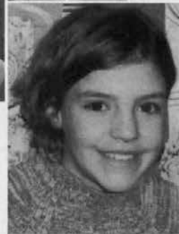
Sky Hall - 47