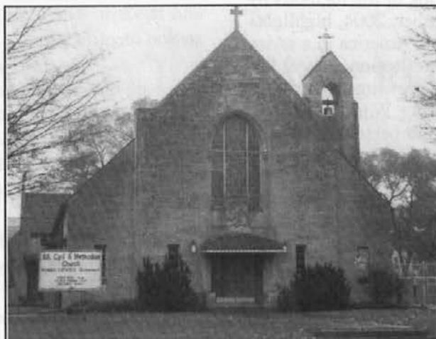
Sts. Cyril and Methodius 1709 E 31st St., Lorain, OH