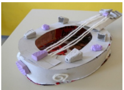
tal group student 165BE.

In conclusion, we can confirm the specific hypothesis (Hb) predicting that 'the cross-curricular integration of art concepts and concepts from other academic subjects influences students' comprehension of art concepts'. The good performance of the students in the experimental group is demonstrated by the results of the written test and the sculptural works created.