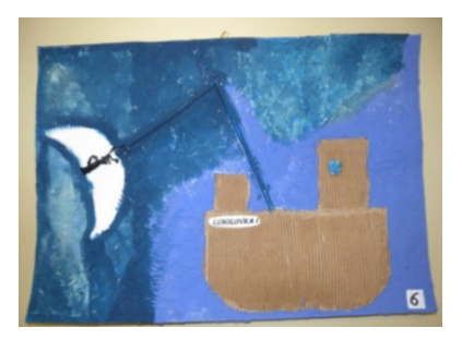
Figure 3. Art work by a control group Figure 4. Art work by an experimenstudent 65BK.