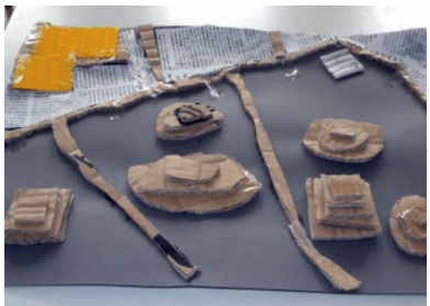
tal group student 25AE.