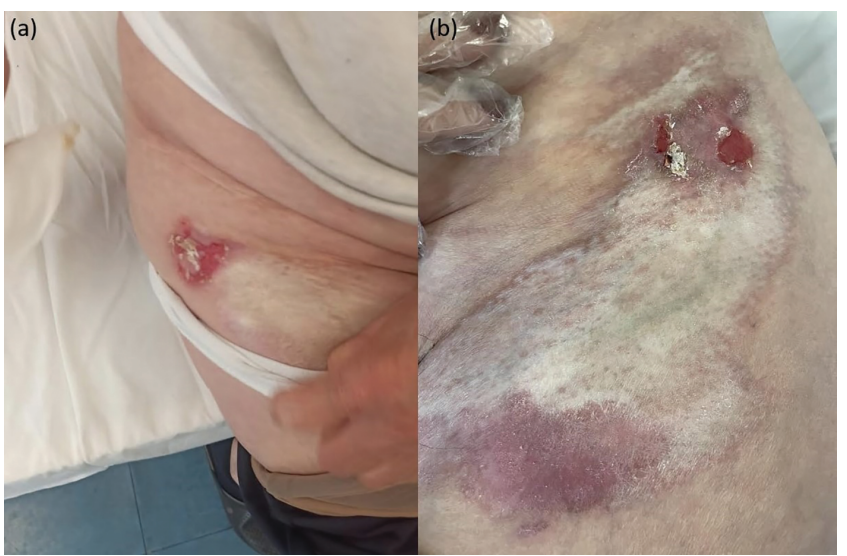
Figure 1 | (a, b) Reddish and whitish indurated plaques with follicular plugging and solitary erosions with hyperkeratosis and crusts.

Biopsies were taken from an indurated plaque with erosion. Histopathology showed hyperkeratosis, interface dermatitis, and flattened rete ridges in the epidermis. In the dermis, there was hyalinosis in the papillary and upper reticular layers, along with focal infiltrates of lymphocytes and some eosinophils (Fig. 2a). A subepidermal cleft was also noted (Fig. 2b). DIF from perilesional