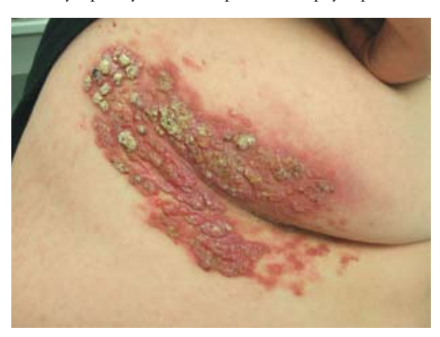
Figure 1. 12-year-old boy with unilateral zosteriform lymphangioma circumscriptum on right T5 dermatome region.

Complete blood count and routine serum chemistries were remarkable for a white blood cell count of 11,000/mL, 65% neutrophils, and 25% lymphocytes. The punch biopsy specimen