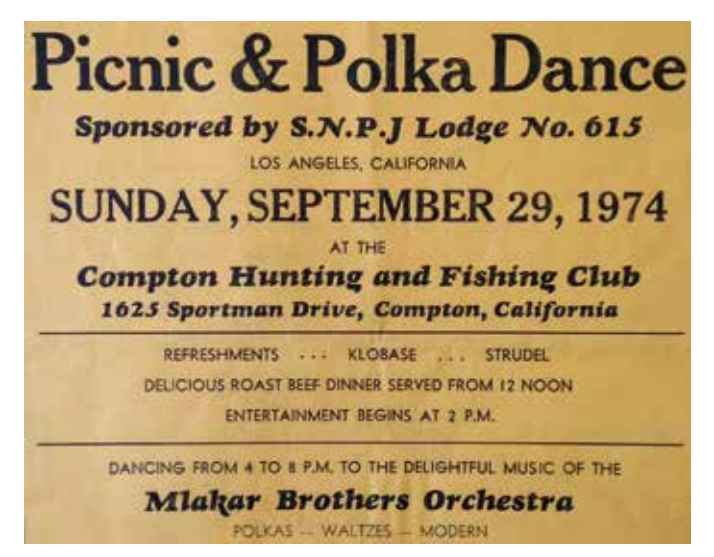
Figure: 4: Compton poster 1974.

SLOVENIAN DANCES AND THEIR SOURCES IN CALIFORNIA