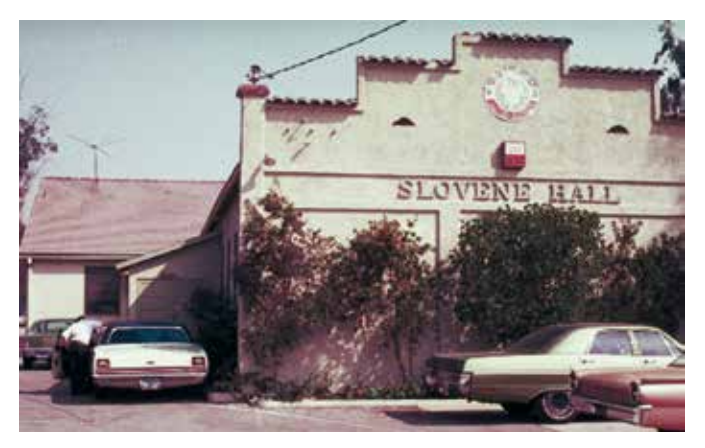
Figure: 3: Hall in Fontana. Photo: E. I. Dunin, 1974.