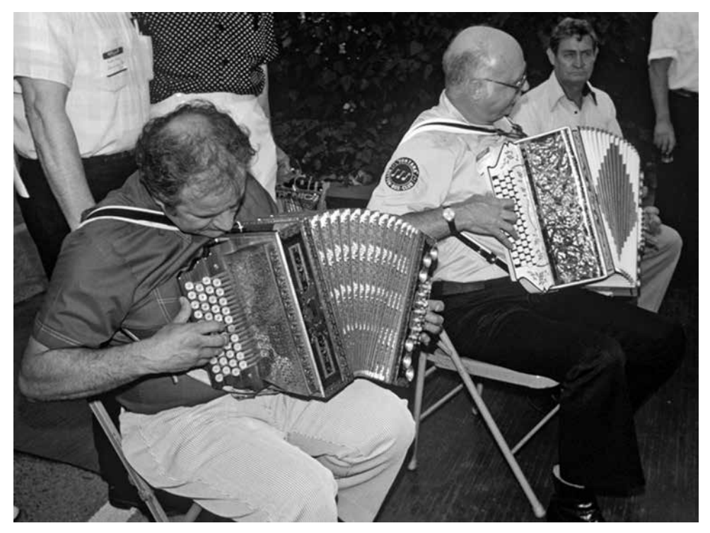
Figure 6: Jamming button-boxers in Fontana 1979.

"Polka" dances in the mid-1970s were frequent events throughout the year with different local orchestras.<sup>16</sup> An expansion of dance music repertoire and style of playing was established through "national" events. In 1979, the second far-west "SNPJ button-box contest" was sponsored by the Fontana Button Box Club, bringing together button-boxer accordionists from San Francisco, Chicago, and Cleveland, along with their differing polka dancing styles, not commonly seen earlier in Fontana. Jamming by musicians between all ages was everywhere and frequent in the weekend event. See Figure 6.