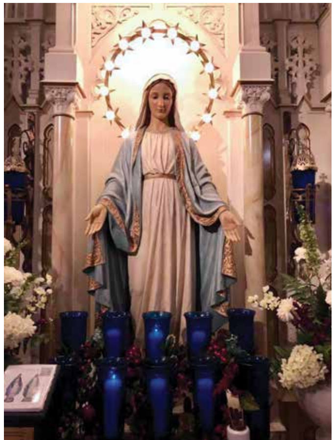
Restored statue of the Virgin Mary at Museum of Statues.