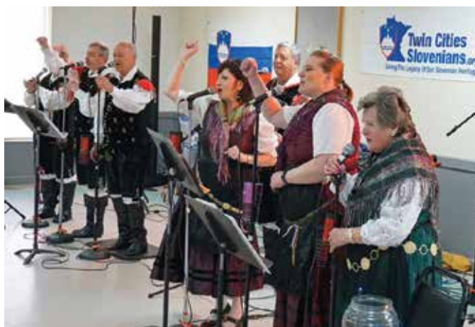
The Singing Slovenes played wonderful music.