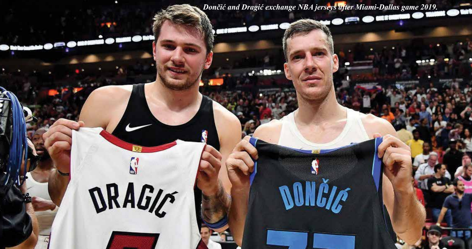
Dončić and Dragić exchange NBA jerseys after Miami-Dallas game 2019.

Slovene fans at Miami vs Dallas pre-game. the Dončić-Dragić face off. The Slovenian fans were easily identifiable in the stands as many wore green scarves and T-shirts that read "I Feel sLOVEnia" with images depicting countrymen Dončić and Dragić. Hundreds of faces in the crowd had temporary tattoos of the Slovenian flag on their cheeks. The National press printed that the arena took on a European soccer match atmosphere with the crowd constantly roaring and chanting equally for both homegrown players. Miami Heat coach, Erik Spoelstra, told reporters after the game, "It felt like we were in Ljubljana". It didn't seem to matter which team won to the visiting Slovenia fans; only the play of their two stars was important. The game stayed close, but the Heat won 105-99. The Heat's ten-year veteran, Goran Dragić, recorded 23 points, 12 rebounds and 11 assists. The Maverick's rookie, Luka Dončić, scored a team-high 19 points.