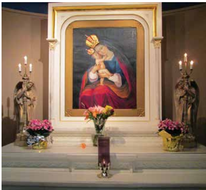
The Marija Pomagaj altar at St. Joseph Church, Joliet.

at our annual St. Joseph Table on March 19 at St. Joseph Parish Hall. Members brought a dish to pass; the meal also included catered fried chicken. We held a brief meeting after dinner in preparation for our April bake sale.