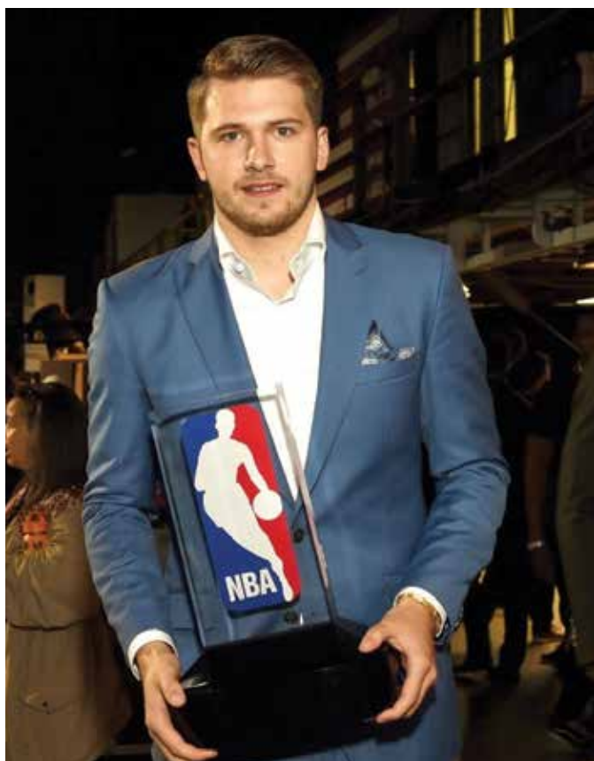
Luka with NBA Rookie of the Year Award 2019.

Luka's former teammate on the Slovenian National Team, Goran Dragić, has been a stand-out guard for NBA's Miami Heat for five seasons. Dragić, too, came out of the Euro League and was drafted in the second round by the San Antonio Spurs. He has been playing in the NBA since 2008. Dončić's first NBA clash against his fellow Slovenian friend obviously became a classic Slovene showdown. Luka and