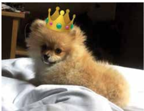
Internet sensation Hugo S. Meker.